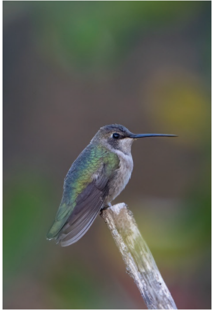
Top: Allen's Hummingbird, Riverhead, Suffolk, 24 Oct, 2023, Bottom left: Rufous Hummingbird, Upper Pine Kill, Sullivan, 23 Jul 2023, Bottom right: Black-chinned Hummingbird, Randall's Island, New York, 19 Nov 2023, See article pp. 270-275.