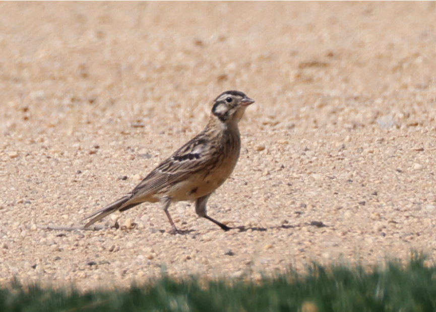
Top: Lark Bunting, Hot Dog Beach, Dune Road, Suffolk , 14 May 2023, © Sean Keenan.