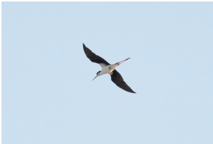
Black-necked Stilt, Breezy Point, Queens , 1 May 2023, © Doug Gochfeld.

European Goldfinch: traditional areas in KING near PP only.