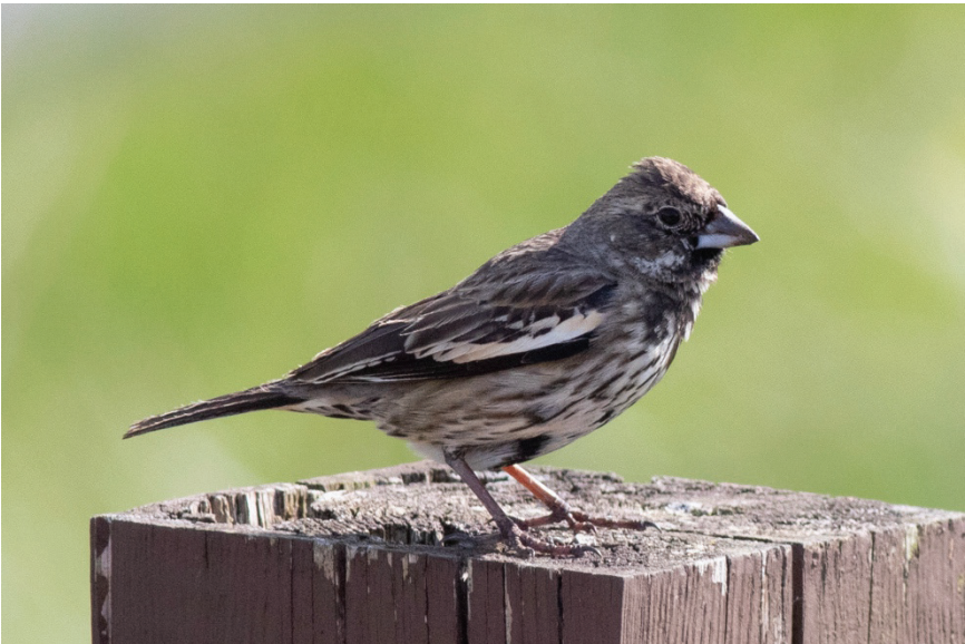
Top: Smith's Longspur, Robert Moses SP, Suffolk, 9 May 2023