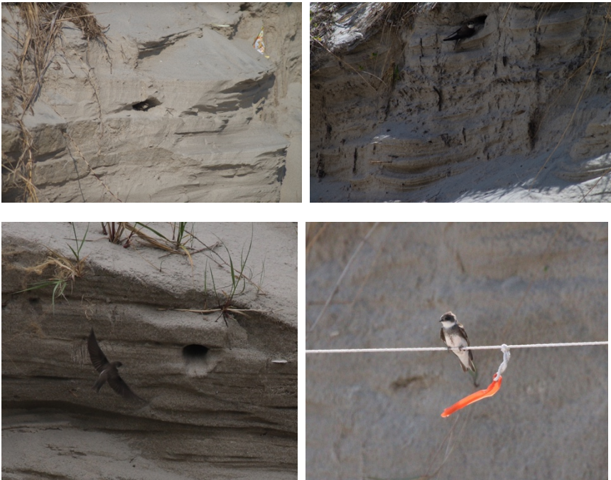
Figure 1. Bank Swallows at Breezy Point Tip, Queens, New York, 2016 – 2018. Photos clockwise from top left: (a) 7 Jun 2016 and (b) 12 Jun 2017, (c) 14 Jun 2018 and (d) 18 Jun 2018. See pp. 210-215.