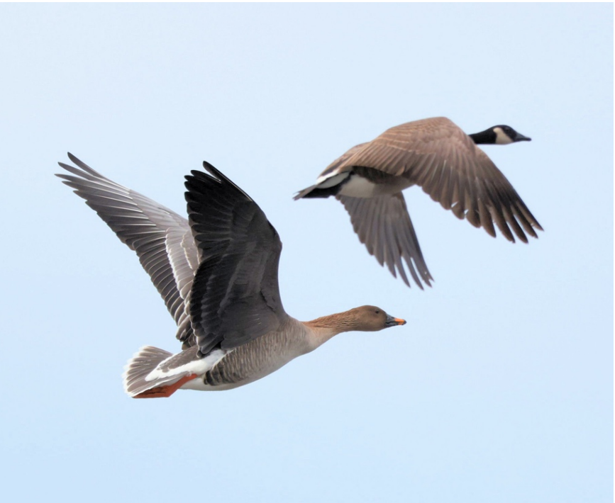
Tundra Bean Goose, Saratoga, 14 & 16 Mar 2021. Top: Saratoga Lake Marine Park, 14 Mar, bottom: Fish Creek Marina, 16 Mar