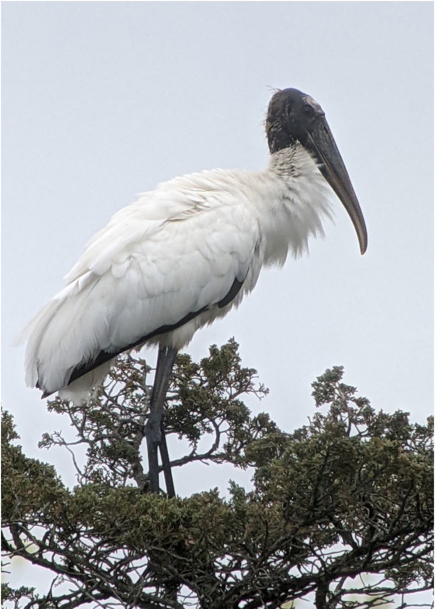
Wood Stork, Beaverdam Creek, Suffolk, 8 May