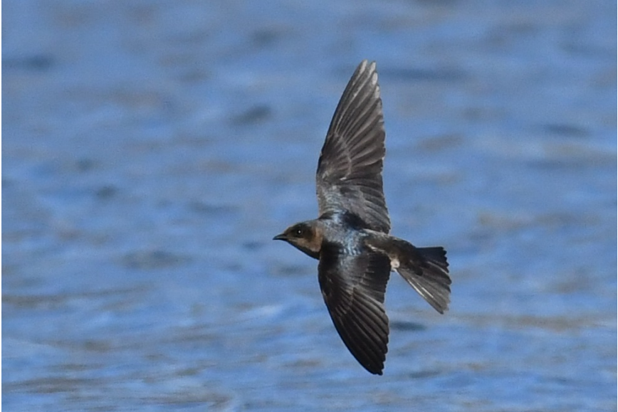
Gray-breasted Martin, Prospect Park, Kings, 1-4 Apr 2021. Top: 2 Apr, bottom: 1 Apr