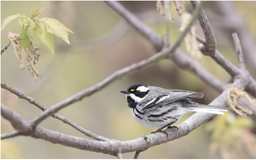
Black-throated Gray Warbler, Amherst State Park, Erie , 22 Apr 2021, © Tony Dvorak.