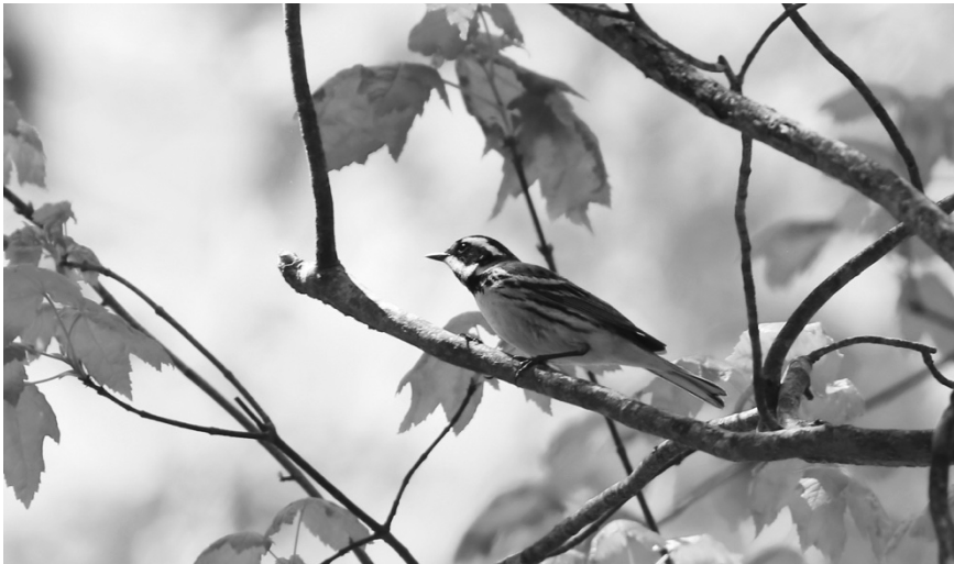
Black-throated Gray Warbler, Preston's Pond, Suffolk , 14 May 2021, © Brenda Bull.