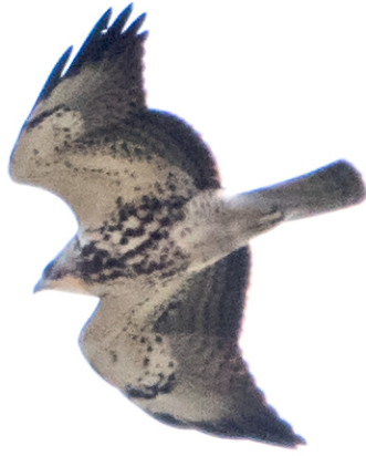
Swainson's Hawk, Hamburg Hawk Watch, Erie, 15 Apr 2020