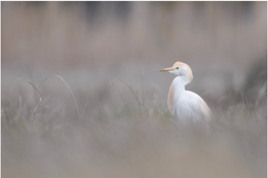
Cattle Egret, Downs Farm Preserve, Suffolk , here 23 Apr 2020, © Jay Rand.