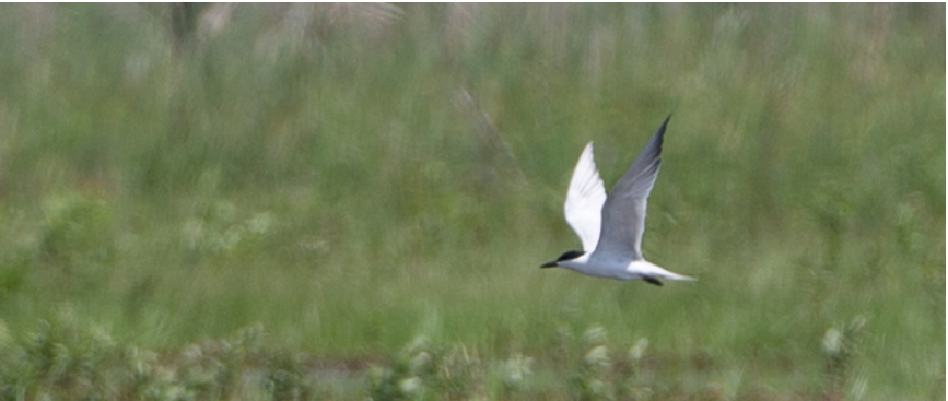
Gull-billed Tern, Iroquois NWR-Kumpf Marsh, Genesee , 25 May 2020.