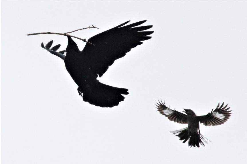
Fish Crow and Northern Mockingbird, Bay Shore, Suffolk , 24 Apr 2020.

Dickcissel: 2 CICP, 16 May (DG), flyovers, first Spring record in eBird for KING.