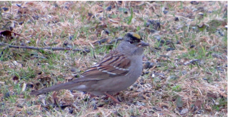
Golden-crowned Sparrow, West Winfield, Herkimer , here 10 Mar 2020, © Wilma Mount.