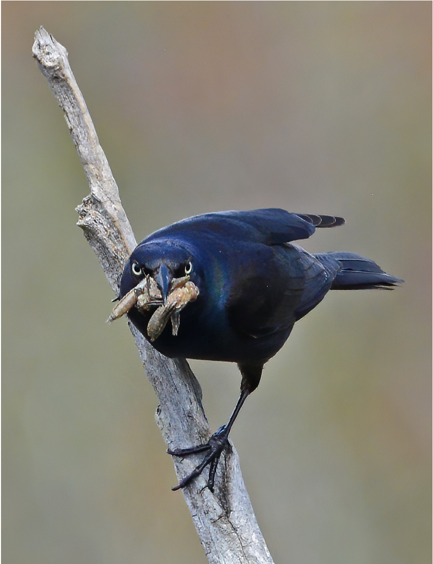
Common Grackle, Tygert Rd., Voorheesville, Albany, 16 May 2020