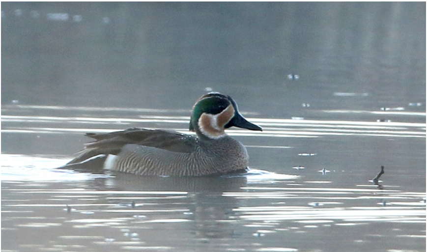
Blue-winged X Green-winged Teal (hybrid), Upper Lisle CP, Broome , 2 Apr 2020, © Jay McGowan.