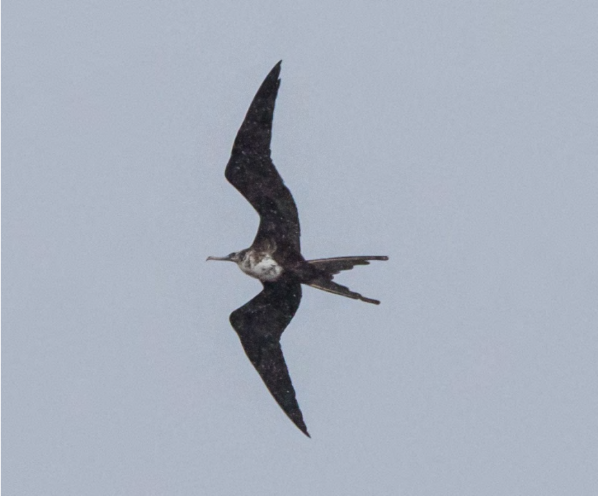
Magnificent Frigatebird, Hamlin Beach SP, Monroe , 27 Apr 2019, © Andrew Guthrie.