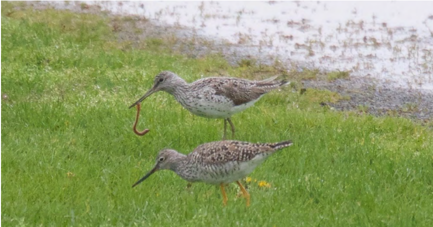
Common Greenshank, Timber Point Golf Course, Suffolk , 5 May 2019, © Tim Dunn.

Corrigenda: In Highlights of the Season—Winter ( The Kingbird 69: 131) a Blue-gray Gnatcatcher was incorrectly attributed to Region 4; it was actually the “bird of the season” for Region 3.