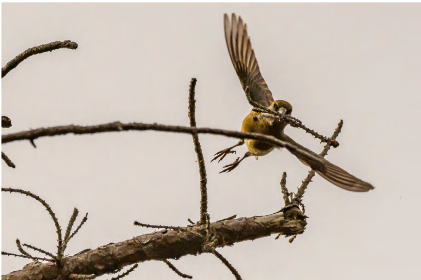
Red Crossbill, Manorville, Suffolk , 15 Apr 2019, © Lisa Nasta.