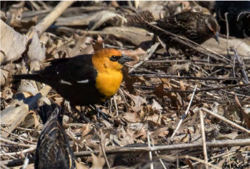
Yellow-headed Blackbird, Black Dirt Region, Orange , 23 Mar 2019, © Matt Zeitler.