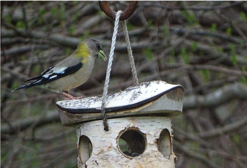
Evening Grosbeak, Northville, Suffolk , 23 Apr 2019, © MaryLaura Lamont.