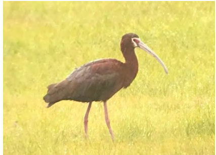
White-faced Ibises in southwestern Suffolk , spring 2019: top left Timber Point Golf Course 15 Apr; top right and bottom left Heckscher SP 1 May; bottom right Heckscher SP 13 May; photos © S. S. Mitra.