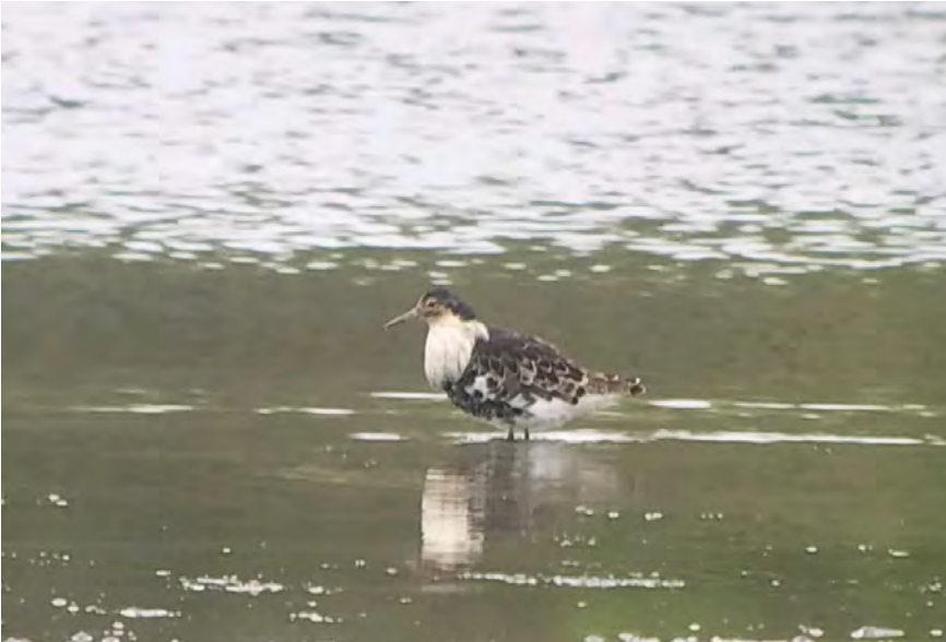
Ruff, Marshlands Conservancy, Westchester, 10 May 2019