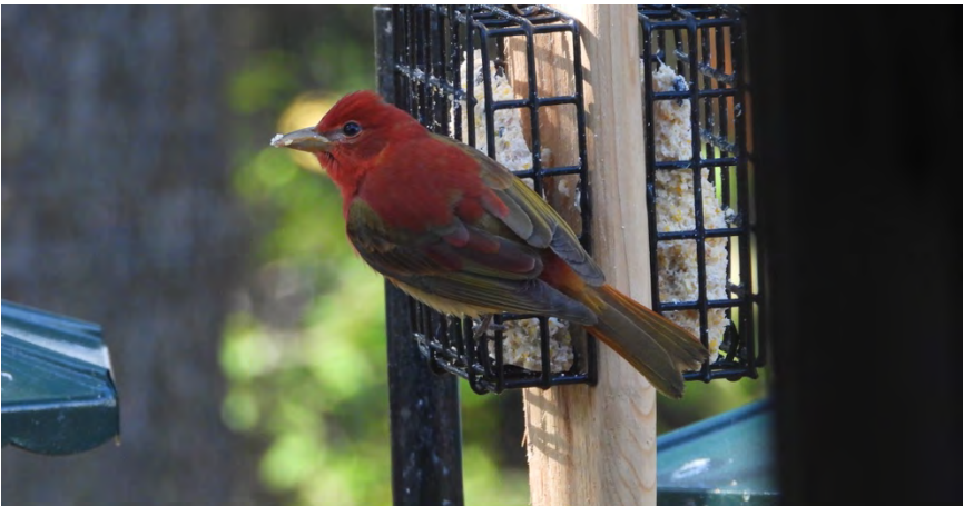
Summer Tanager, Guilderland, Albany, 29 Apr 2019