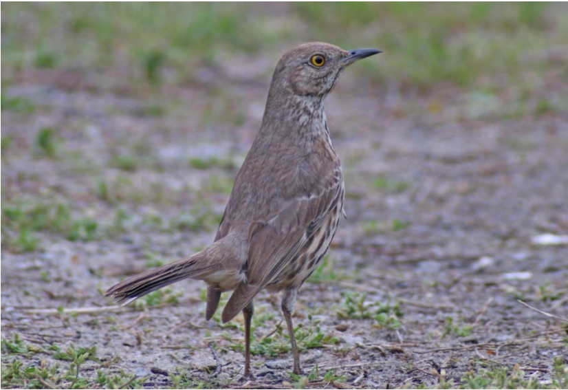
Two major rarities at Jamaica Bay Wildlife Refuge, Queens : Burrowing Owl, 16 May 2019, © Jennifer Kepler; and Sage Thrasher, 17 May 2019, © Corey Finger.