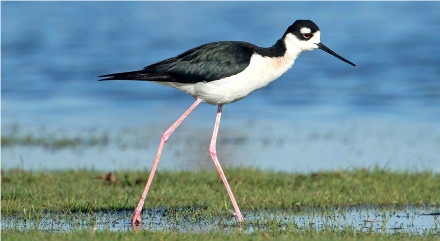
Black-necked Stilt, Nickerson Beach, Nassau, 21 Apr 2019