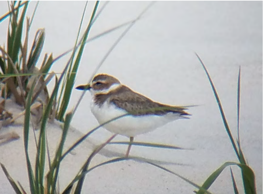
Wilson's Plover, Cupsogue County Park, Suffolk, 15 May 2019