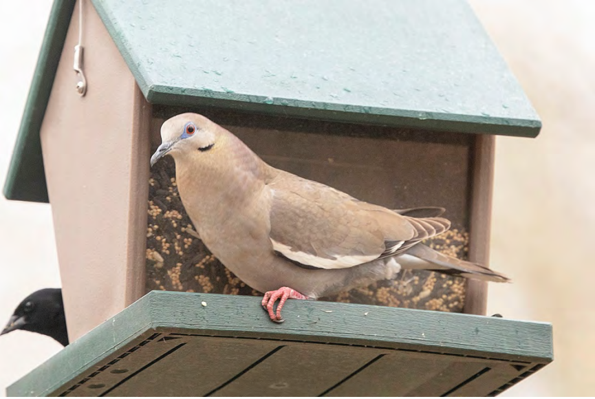
White-winged Dove, Central Park, New York , 14 Apr 2019, © Peter Post.