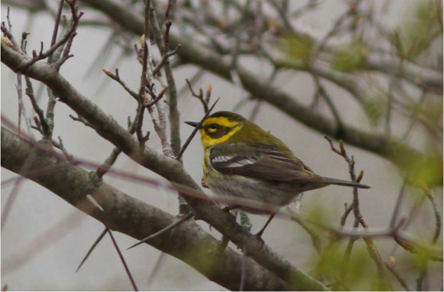
Townsend's Warbler, West Barrier Bar County Park, Cayuga, 2 May 2019