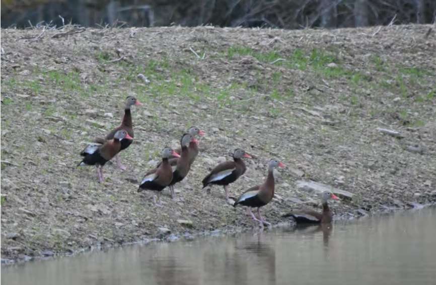
Black-bellied Whistling-Ducks, Rexville, Steuben , 19 May 2019.