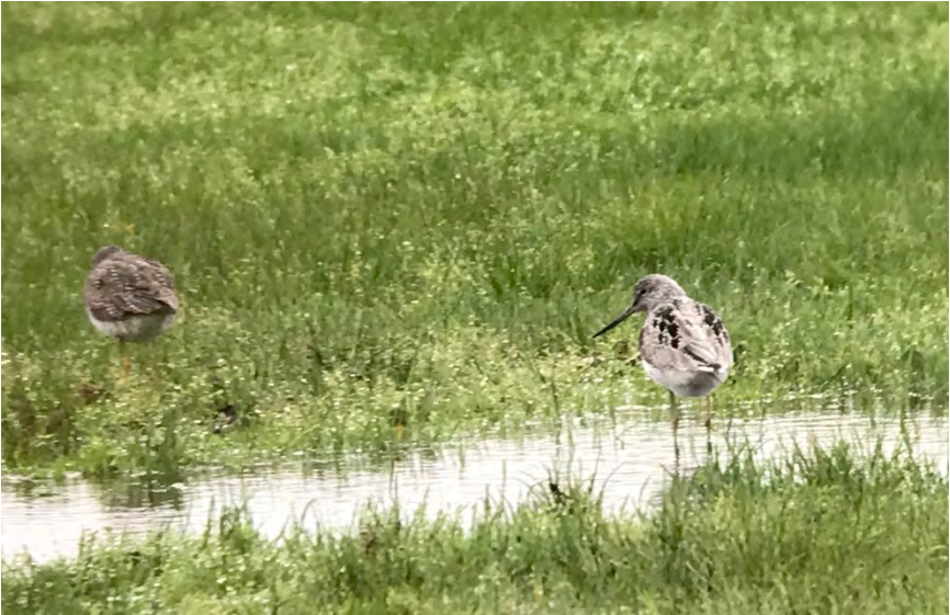
A Common Greenshank at Timber Point Golf Course, Suffolk , 5-6 May 2019 (here 5 May) was the first for NYS and one of very few records for the eastern USA. See article pp. 202-205; photos © S. S. Mitra.