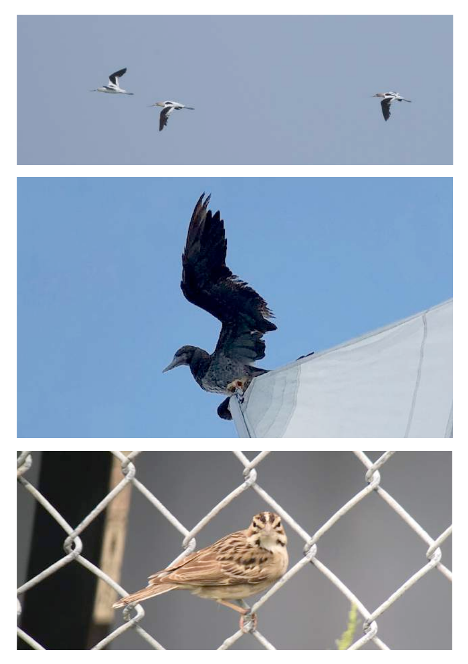
American Avocets, West Barrier Bar CP, Cayuga, 7 Aug 2018, Brown Booby, Long Lake, Hamilton, 25 Aug 2018, Lark Sparrow, Randall's Island, New York, 31 Aug 2018