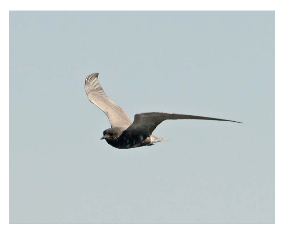
Black Tern, Round Lake, Saratoga, 4 Jul 2017, © Scott Stoner.