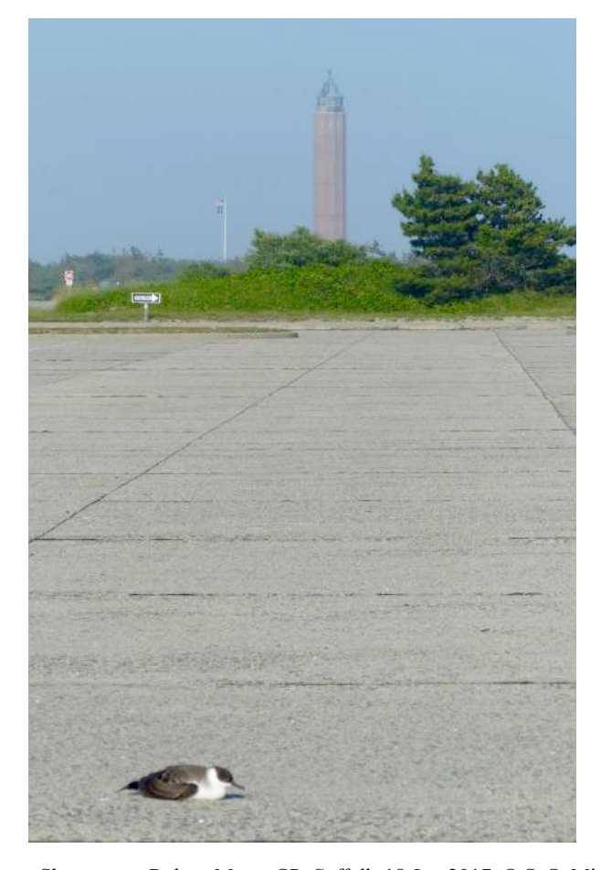
Great Shearwater, Robert Moses SP, Suffolk, 18 Jun 2017