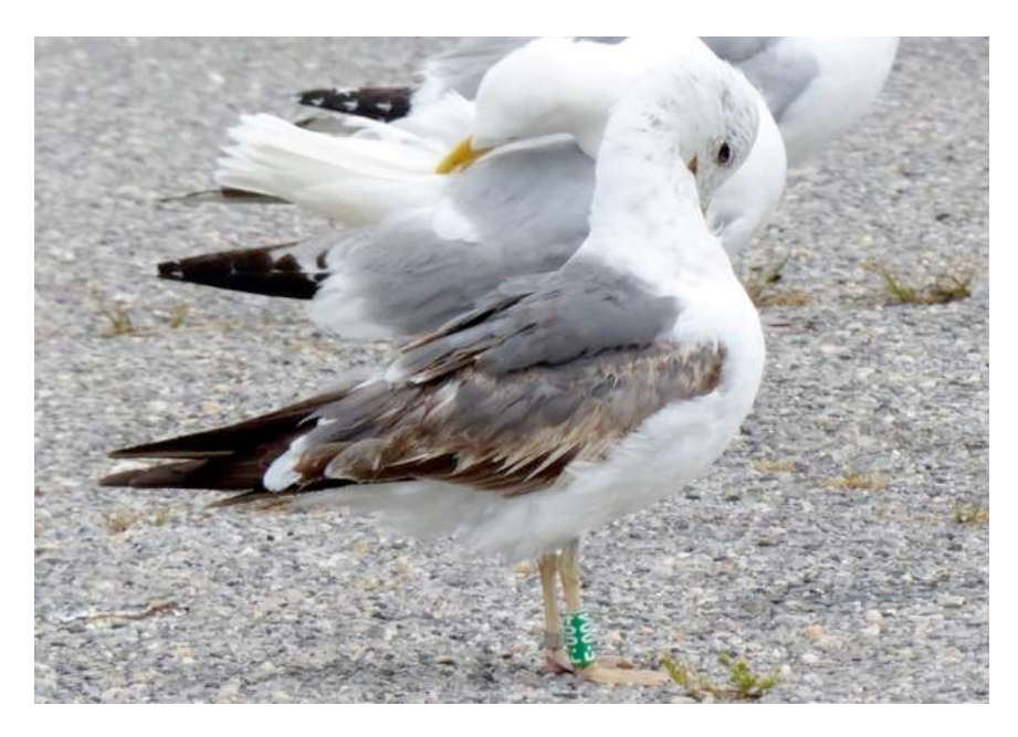
This Lesser Black-backed Gull was observed and photographed at Heckscher SP, Suffolk , on 1 Jul 2017 by Ken Thompson. A note on p. 304 describes what was learned from its colorband.