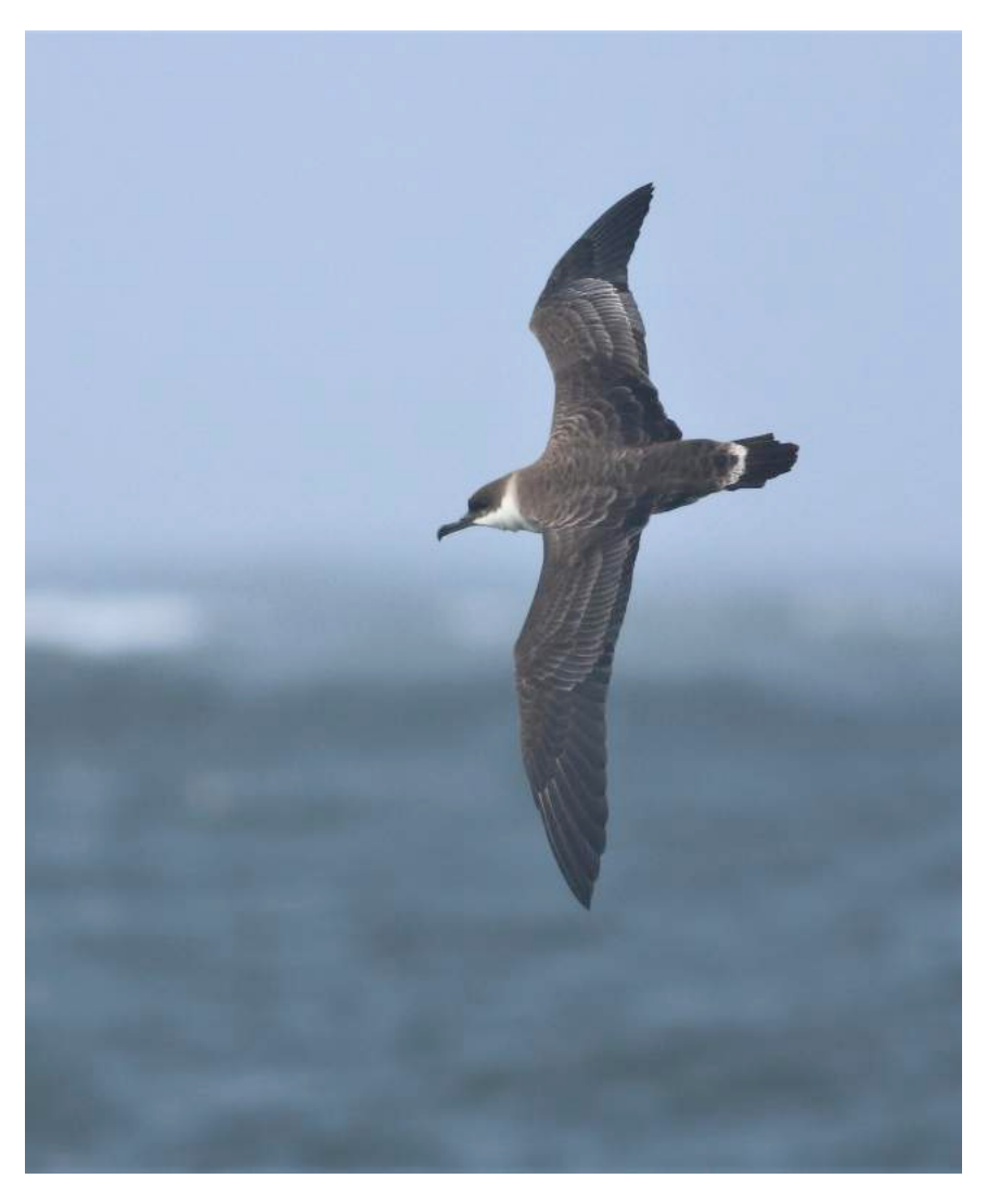
Great Shearwater, Nickerson Beach, Nassau, 18 Jun 2017, See the Region 10 report in this issue for details concerning a major flight and subsequent mortality event involving Great Shearwaters along the western shore of Long Island on 18 Jun 2017.