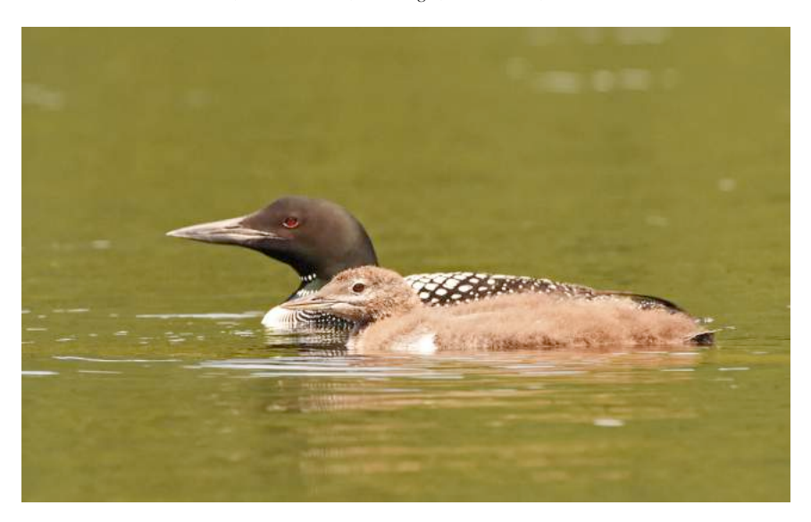
Common Loons, Warren, 16 Jul 2017