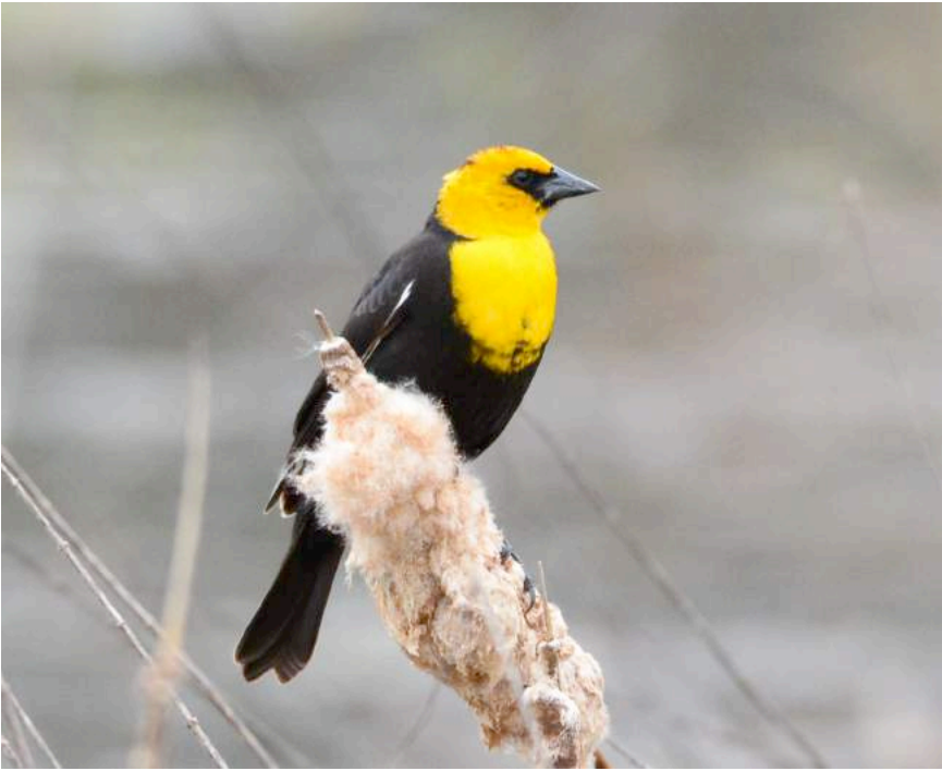
Yellow-headed Blackbird, Boland Pond, Broome , 13 Apr 2016, © George Chiu.