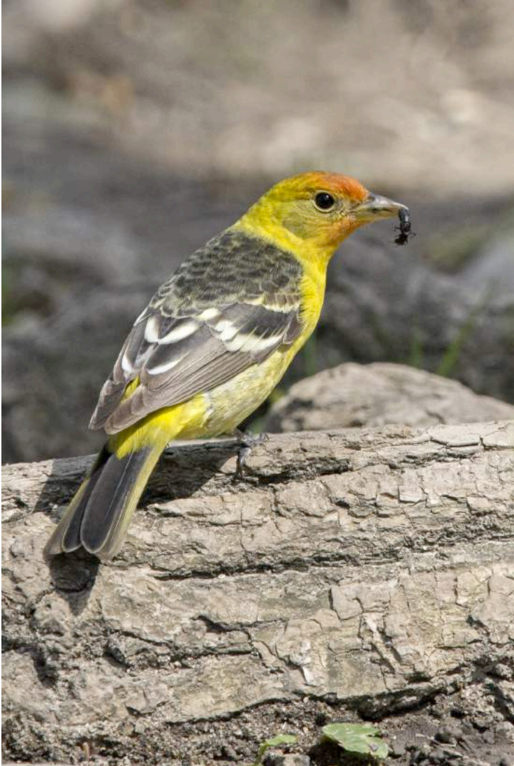
Western Tanager, Amherst SP, Erie, 7 May 2016