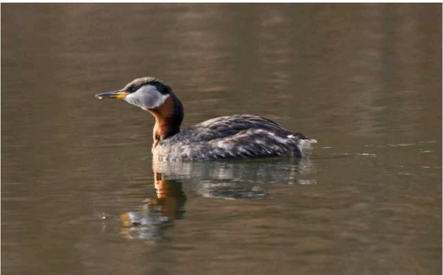
Red-necked Grebe, Buckingham Pond, Albany , 9 April 2016, © Scott Stoner.