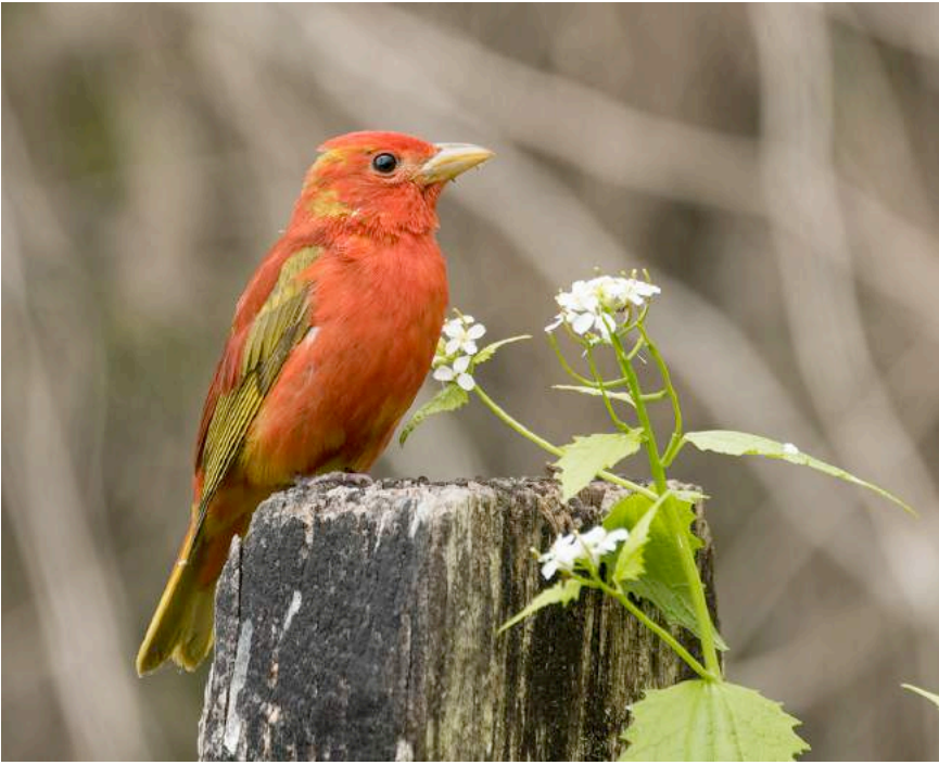
Summer Tanager, Chautauqua, Chautauqua, 17 May 2016