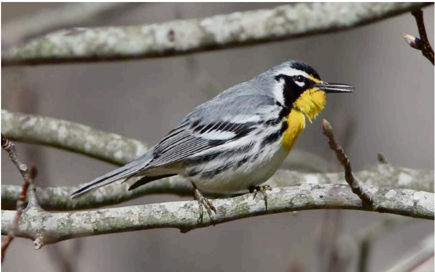
Yellow-throated Warbler, Connetquot River SP, Suffolk , 10 Apr 2016, Ken Fuestel.