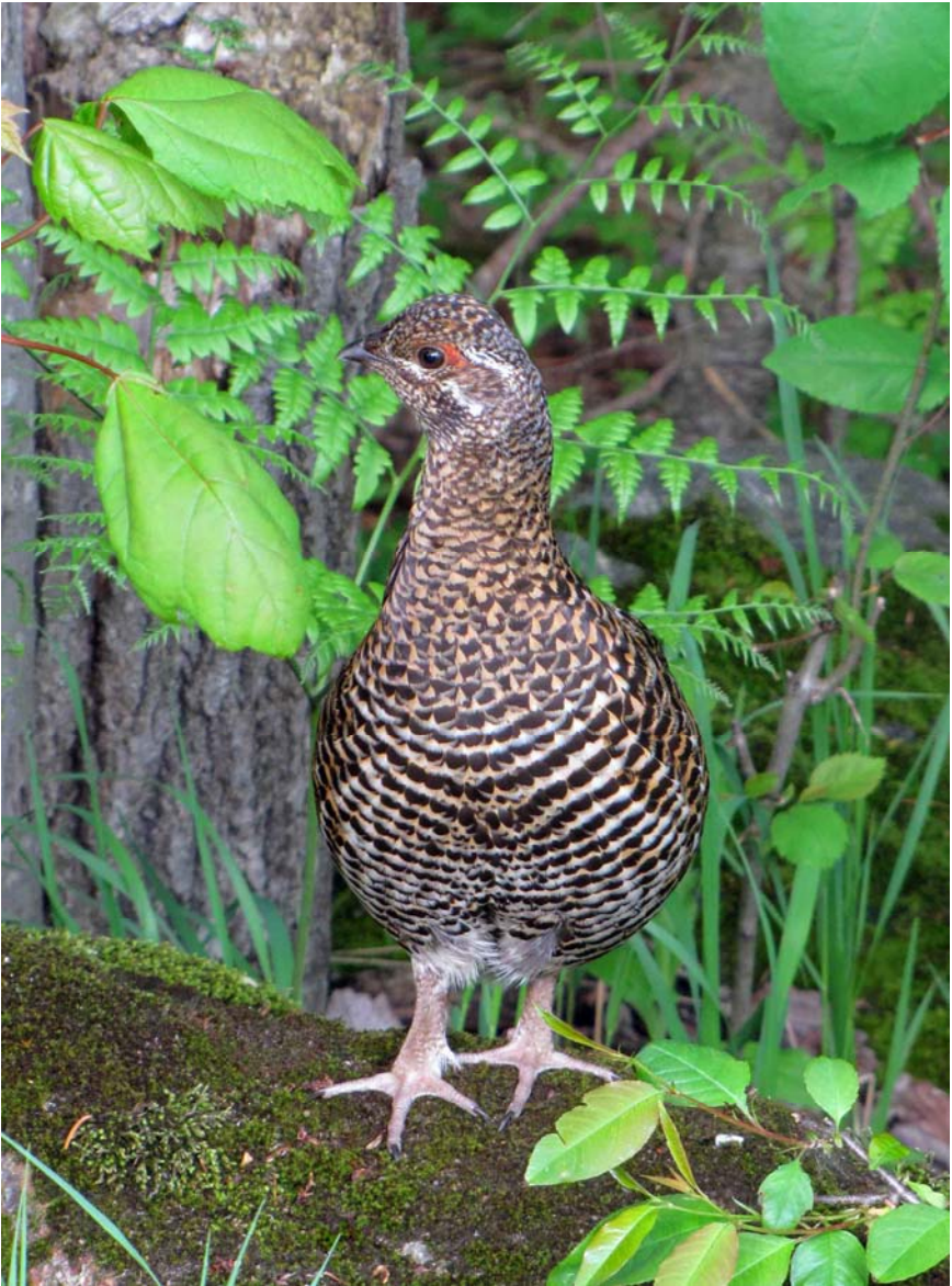
Figure 1. Spruce Grouse, Parishville, St. Lawrence , 28 May 2011, © Melissa Burchard.