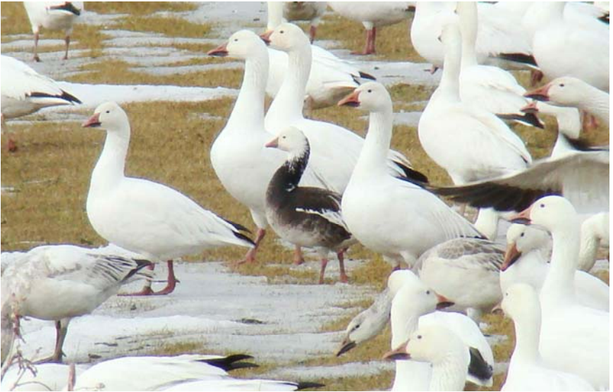
Figure 7. Dark morph Ross's Goose, Pine Island, Orange , 5 Mar 11. The dark morph of Ross's Goose is much rarer than that of Snow Goose ("Blue" Goose). This bird was part of an exceptional aggregation of rare waterfowl described in detail in Mike Bochnik's Region 9 report, pp. 274-279.