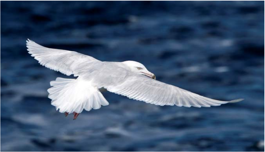
Figure 6. Glaucous Gull, pelagic out of Freeport, Nassau , 27 Mar 2011, © Peter Post.