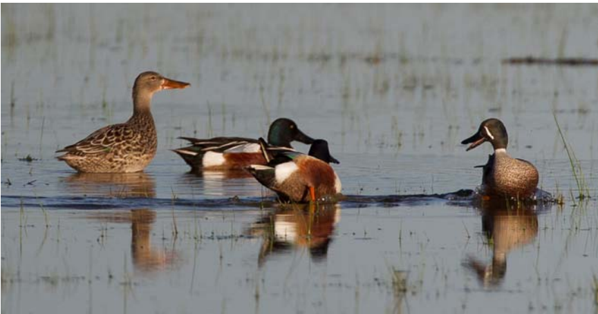
Figure 3. Blue-winged Teal x Northern Shoveler hybrid, Montezuma NWR, Seneca , 19 May 2011, © C. L. Wood. The Blue-winged Teal influences are best appreciated when the bird is head-on. In addition to the obvious white crescent on the face (narrower than in Blue-winged), note the pale brown breast with fine spotting. The head appeared glossy green, similar in color to Northern Shoveler. See pp. 206-207.