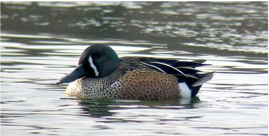
Figure 5. Blue-winged Teal x Northern Shoveler hybrid, Prospect Park, Kings , 22 Jan 2010. Note that this bird also shows a green head and finer markings on the breast than one would expect in Australian Shoveler. See pp. 206-207.