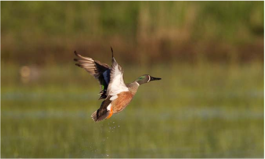
Figure 4. Details same as in Fig. 3. Note the extensive cinnamon sides similar to a Northern Shoveler but with small black spotting. The color is richest in the center and paler on top and near the rump. The extensive green in the secondaries and blue upperwing coverts bordered by a bold white bar are very similar to the upperwing of a Northern Shoveler, as is the bold white underwing. The tail appears similar to that of a Blue-winged Teal. Also note the brownish breast with fine black spotting, white neck-ring, and white facial crescent.