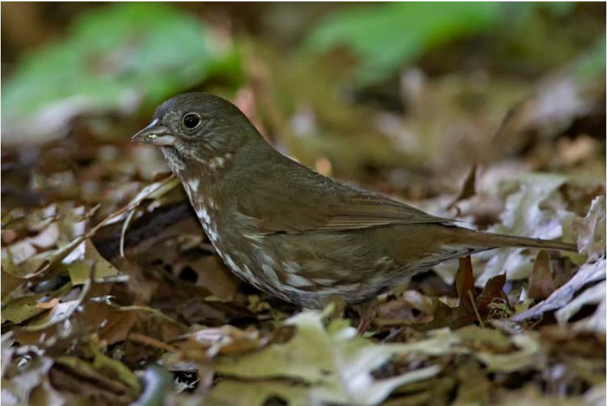
Figure 2. Fox Sparrow, Central Park, New York , 13 May 2010. Stephen Chang presents a case that this bird is an example of the western North American “Sooty” Fox Sparrow (subspecies group unalaschensis ) in this issue, pp. 203-205.