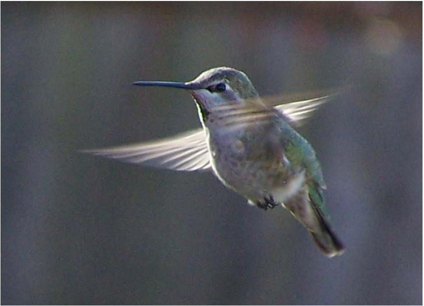
Anna's Hummingbird, Liberty, Sullivan, 29 Oct 2007, See pp. 86-89.