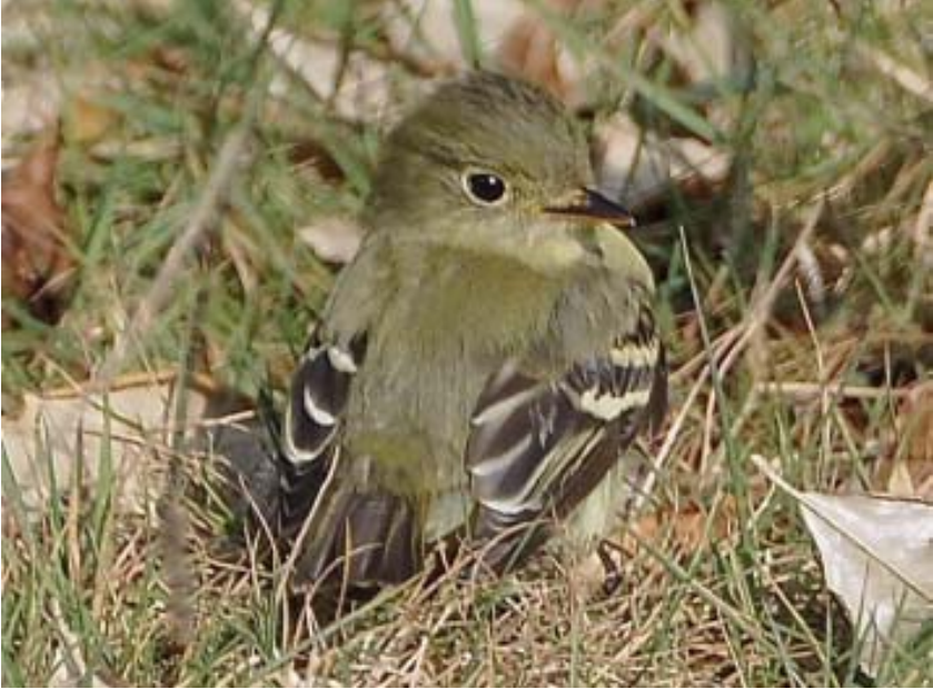
Yellow-bellied Flycatcher, Zach's Bay, Nassau , 6 Dec 09. Top left: Note lack of contrast between yellow-green throat and upper breast, full eye-ring, and big-headed appearance; top right: differs from "Western" Flycatcher in darker (black) wings, shorter tail, and longer primary projection; bottom: bill broad-based and spade-shaped, with convex edges and orange lower mandible. See pp. 90-94.