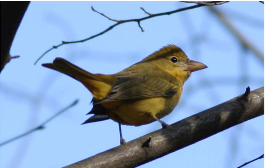
Summer Tanager, Clove Lakes Park, Richmond, 8 Dec 09