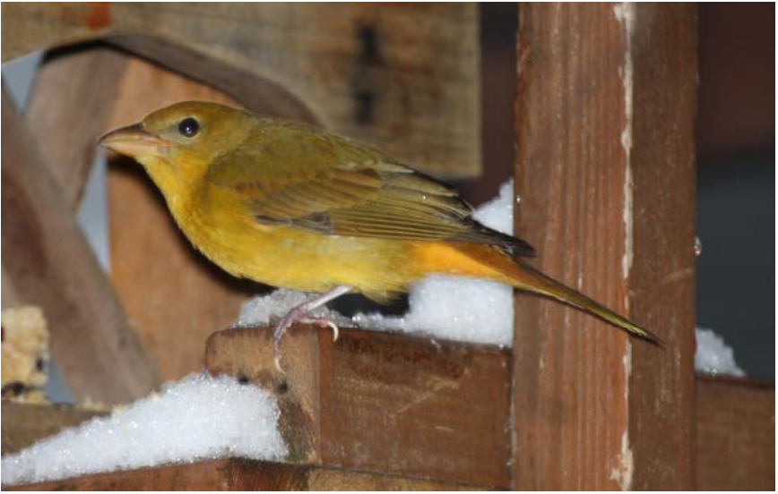
Summer Tanager, Spencerport, Monroe , 9 Dec 09, © Dominic Sherony.