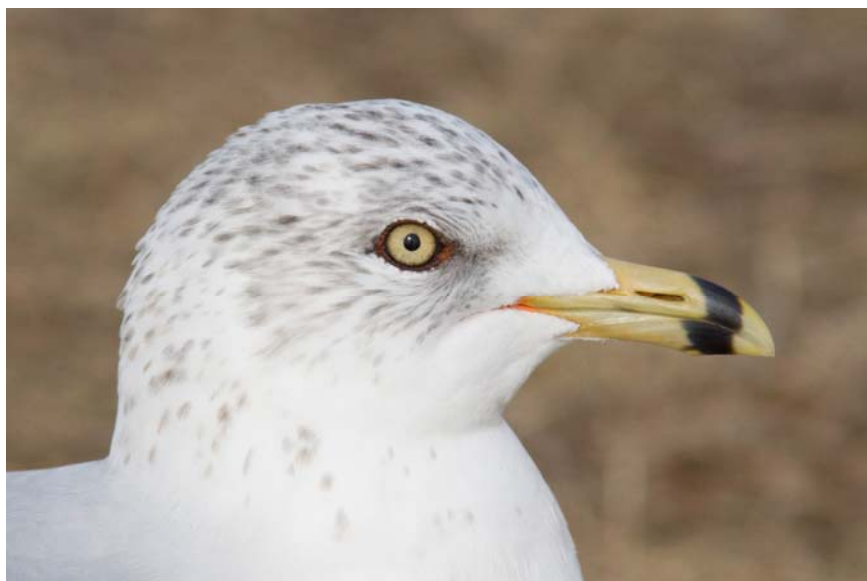
Mew Gull (top) and Ring-billed Gull (bottom), Gravesend Bay, Kings , 22 Jan 10, © Peter Post. See Region 10 report.