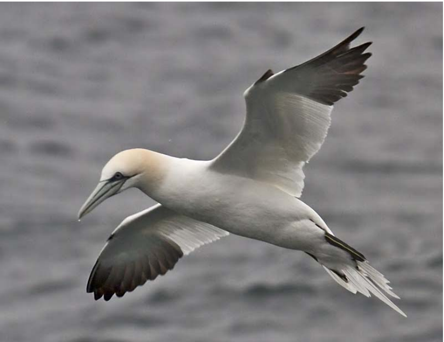
Dovekie, Great River, Suffolk, 28 Jan 10, Northern Gannet, Atlantic Ocean, 17 Jan 10