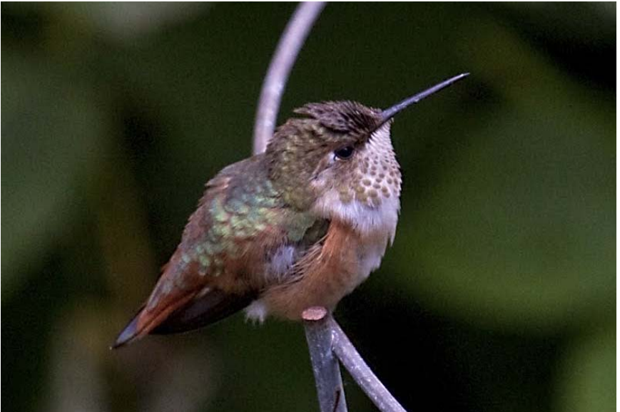
Rufous Hummingbird, Grymes Hill, Richmond , 14 Oct 09, © Andrew Baksh. See pp. 86-89.