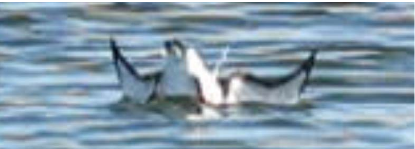
“Arctic” Black Guillemot, subspecies mandtii/ultimus, Sebonac Inlet, Suffolk. See Region 10 report.