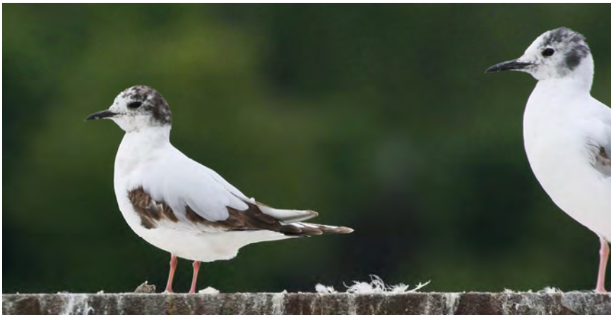
Figure C. Little Gull, Fort Niagara, Niagara Co., 13 Jun 09, © Gary Chapin.