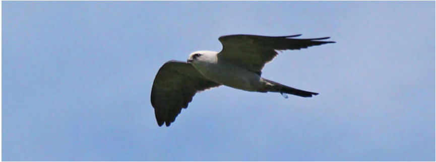
Figure A. Mississippi Kite, Root, Montgomery Co., © Courtney Moore.