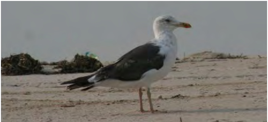
Figure F. Lesser Black-backed Gulls, 3 of 13 present at Jones Beach SP, Nassau Co., 24 Aug 09, © Brendan Fogarty. See Notes and Observations, p. 338.