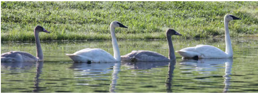
Figure B. Trumpeter Swans, Hogback Rd., Wayne Co., 12 Aug 09, © Dominic Sherony.