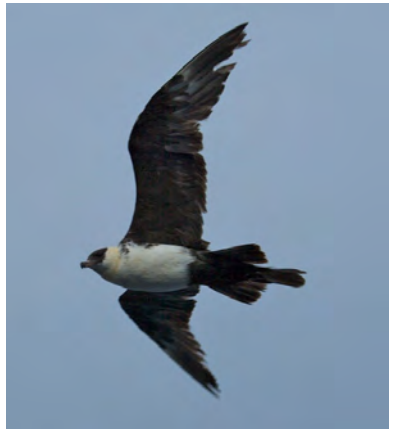
Figure E. Clockwise from top: White-faced Storm-Petrel, 95 mi sse Shinnecock Inlet, 16 Aug 09; Leach's Storm-Petrel, 92 mi sse Shinnecock Inlet, 16 Aug 09; Pomarine Jaeger, 92 mi sse Shinnecock Inlet, 3 Jul 09; South Polar Skua, 48 mi sse Shinnecock Inlet, 27 Jun 09; Audubon's Shearwater, 82 mi sse Shinnecock Inlet, 16 Aug 09; all © John Shemilt.