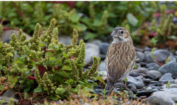
Figure D. Photos from the New York State Avian Records Committee's Annual Report for 2007. Townsend's Solitaire, Oak Beach, Suffolk Co., 20 Dec 07, Snow Bunting, Piermont Pier, Rockland Co., 25 Jun 07, Lark Bunting, Myer's Pt., Tompkins Co., 9 Sep 07, See pp. 306-332.