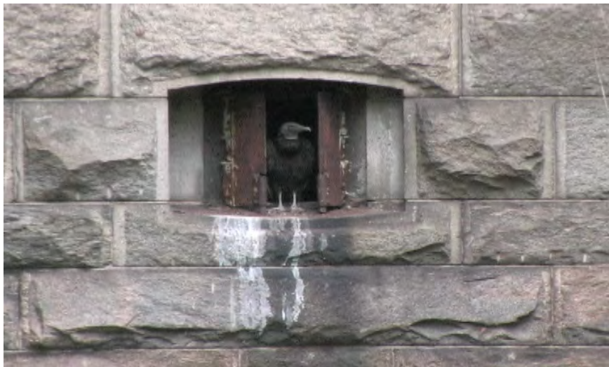
Black Vulture, Fort Wadsworth, Staten Island, 16 Jul 09. First confirmed Region 10 breeding record. Video still copyright Jason Wickersty, National Park Service.