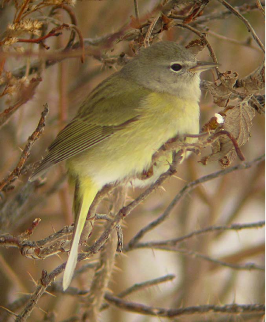
Figure A. Orange-crowned Warbler, Jamaica Bay Wildlife Refuge, Kings County, 20 Dec 08.