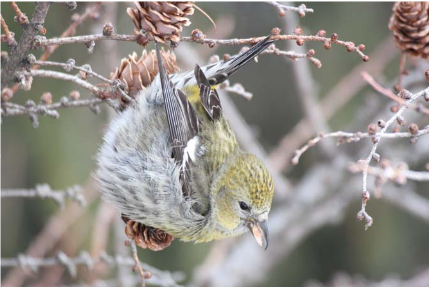
Figure B. White-winged Crossbills, Golden Hill SP, Niagara County, 19 Jan 09.