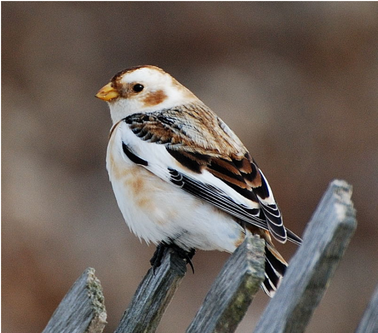
Figure C. White-winged Crossbill, Jones Beach West End, Nassau County, 20 Jan 09, copyright Ken Feustel; Snow Bunting, Jones Beach West End, Nassau County 26 Dec 08, copyright Ken Feustel.