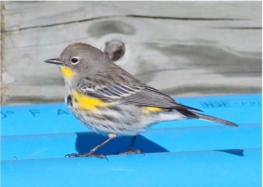
Figure D. “Eurasian” Green-winged Teal, Milburn Pond, Nassau County, 24 Jan 09, “Audubon’s” Yellow-rumped Warbler, Tobay, Nassau County, 4 Jan 09