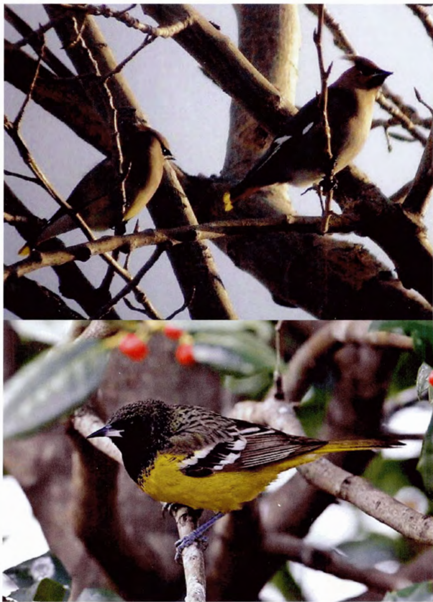
Figure C. Top: Bohemian Waxwing (right, with Cedar Waxwing), Newfane, Niagara Co., 21 Jan 2008. Bottom: Scott's Oriole, Union Square Park, New York Co., 24 Jan 2008. See pp. 102-103.