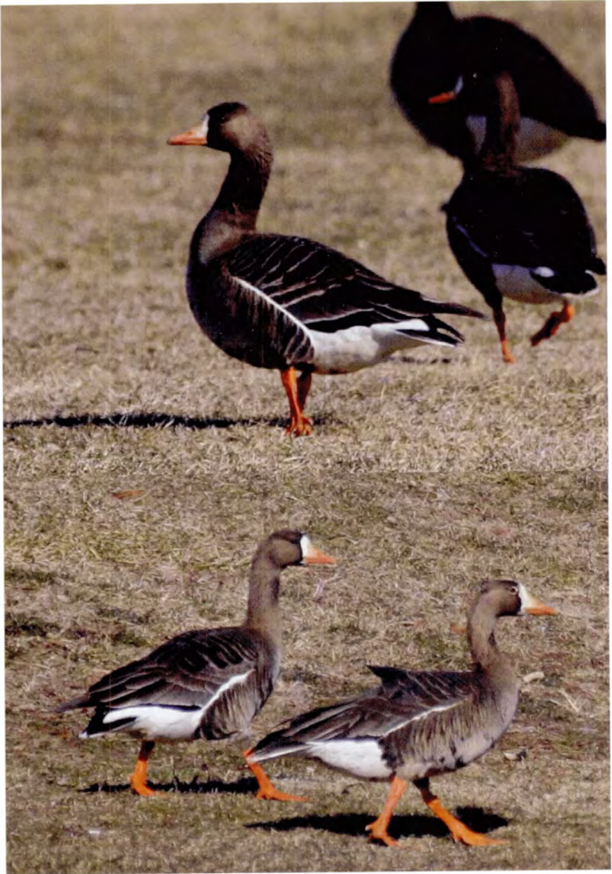
Figure D. Greater White-fronted geese at Lido Beach, Nassau Co., 23 Jan 2008. Six birds were present. See pp. 103-104.