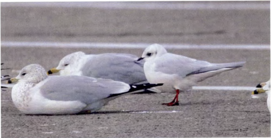
Figure A. Ross's Gull at Niagara Falls, Niagara Co., 30 Jan 2008, See pp. 98-102.