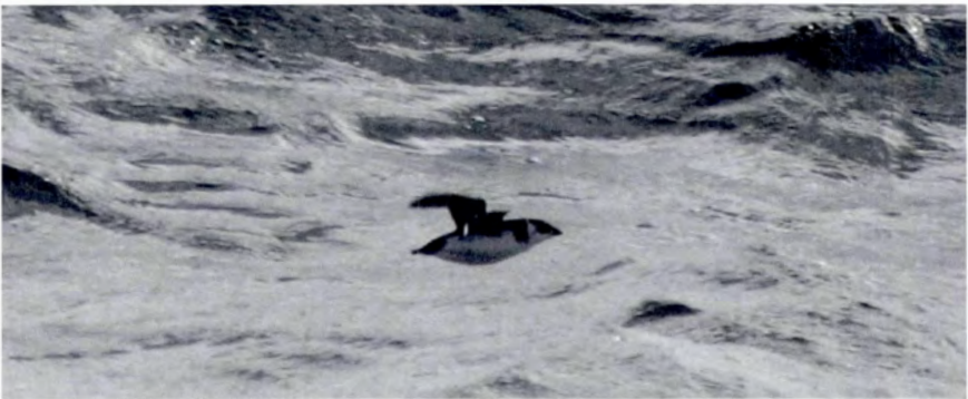
Figure H. Northern Gannet (top), Common Murre (middle), Dovekie (bottom), Hudson Valley Shelf, 10 Feb 2007