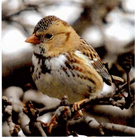
Figure D. Yellow Warbler, Ithaca, Tompkins Co., 31 Dec 06. Figure E. Harris's Sparrow, Irondequoit, Monroe Co., 23 Dec 2006.