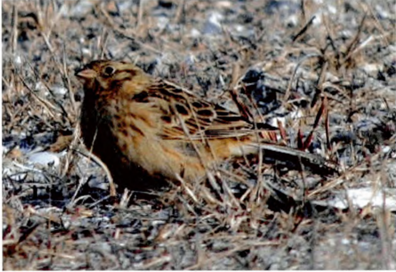
Figure C. Smith's Longspur, Jones Beach West End, Nassau Co., 12 Feb 2007, copyright Ed Coyle.