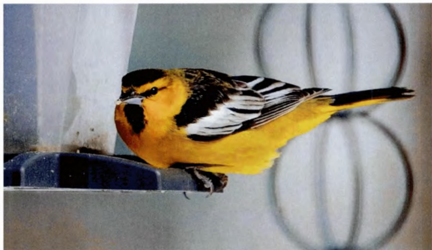
Figure F. Western Tanager, Baldwin, Nassau County, 11 Feb 07, Figure G. Bullock's Oriole, Phoenicia, Ulster County, 9 March 2007.