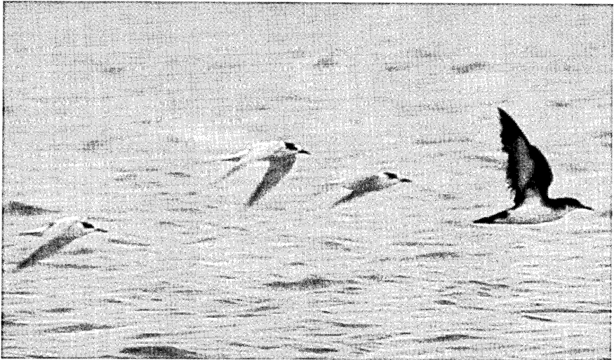
Figure 2. Manx Shearwater ( Puffinus puffinus ), with Common Terns ( Sterna hirundo ), Jones Inlet, Nassau Co., NY. 26 September 2005.