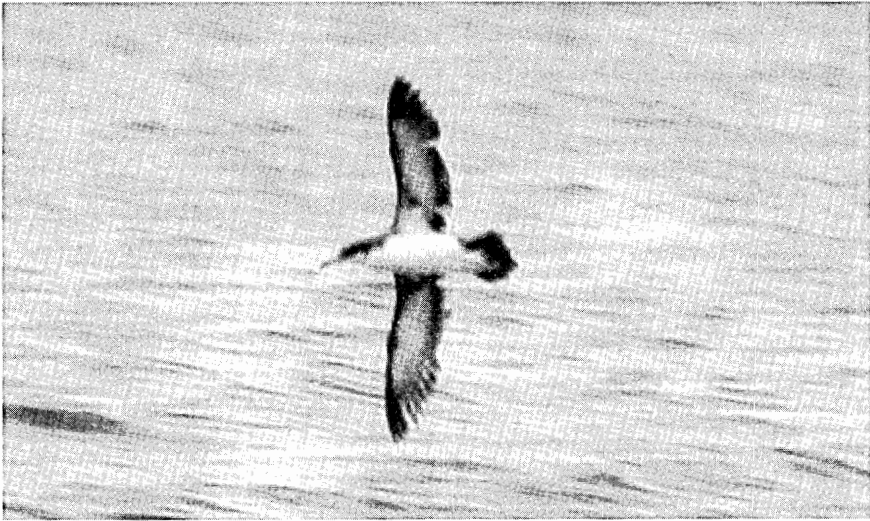
Figure 3. Manx Shearwater ( Puffinus puffinus ), Jones Inlet, Nassau Co., NY. 26 September 2005.