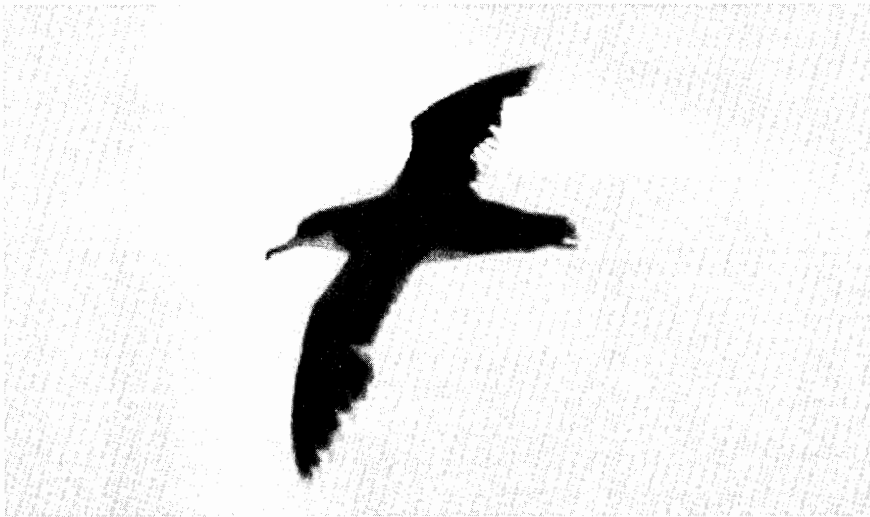
Figure 4. Manx Shearwater ( Puffinus puffinus ), Jones Inlet, Nassau Co., NY. 26 September 2005.