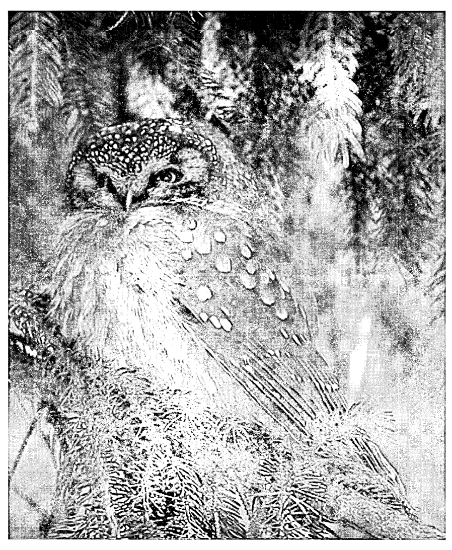
Figure 1. Boreal Owl ( Aegolius funereus ), Central Park, New York City. 20 December 2004, Lloyd Spitalnik.