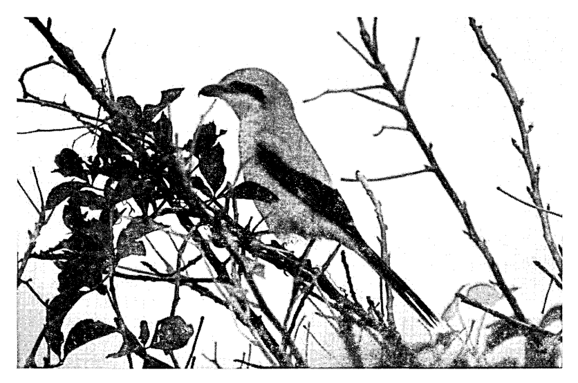
Northern Shrikes are sought after birds on New York Christmas Bird Counts. During the winter of 2004/05, this species was found in better than average numbers on many upstate counts, but it was scarce to absent downstate. Cedar Beach, Suffolk County, 30 Oct 2004.

The data presented in this issue are far from perfect, but it is my hope that they will be a source of information and pleasure for present and future readers of The Kingbird .