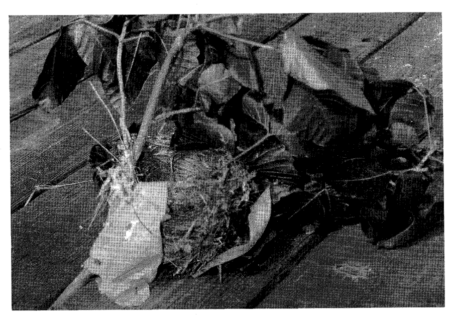
Figure 2. Nest of Blue Grosbeak