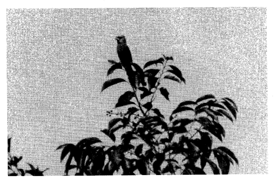
Figure 1. Male Blue Grosbeak