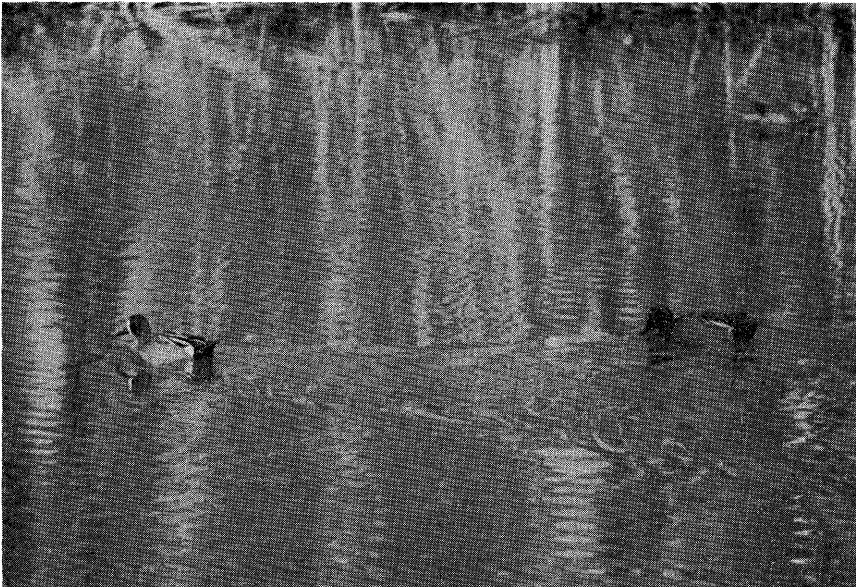
Figure 1 — Blue-winged Teal drake (left) with Cinnamon Teal drake in pursuit.