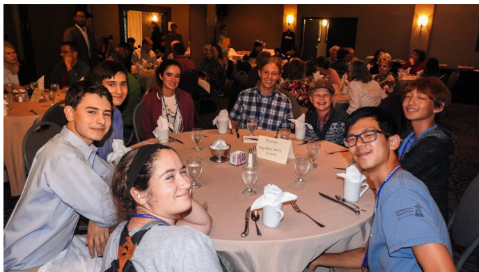
Young Birders enjoy the Annual Meeting Banquet.