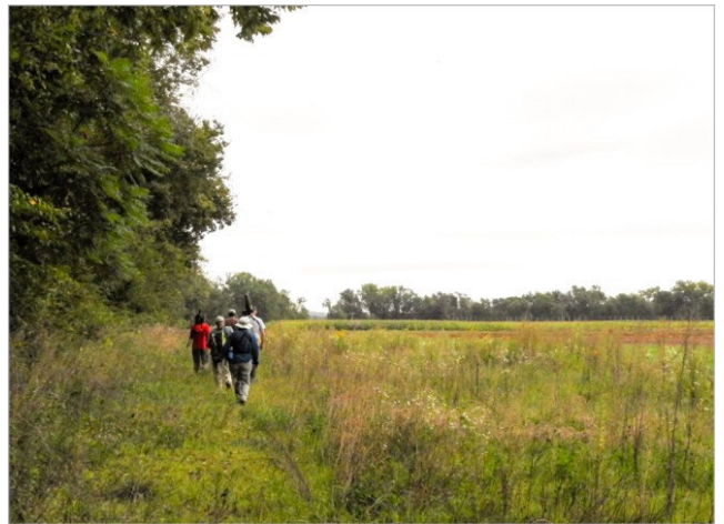
Delegates' Field Trip

Outgoing President Mike DeSha reported on the year's activities, including our many conservation activities: endorsement of the American Bird Conservancy's letter to the Department of Homeland Security and U. S. Customs and Border Security opposing the environmental damage, and encroachment on natural areas by the building of the border wall; raising awareness about the need to find a solution to harassment of birds by people who are alerted to the location of rarities and nesting sites by postings on electronic media; and ongoing work to develop a stance with respect to large-scale solar farms' impact on birds.